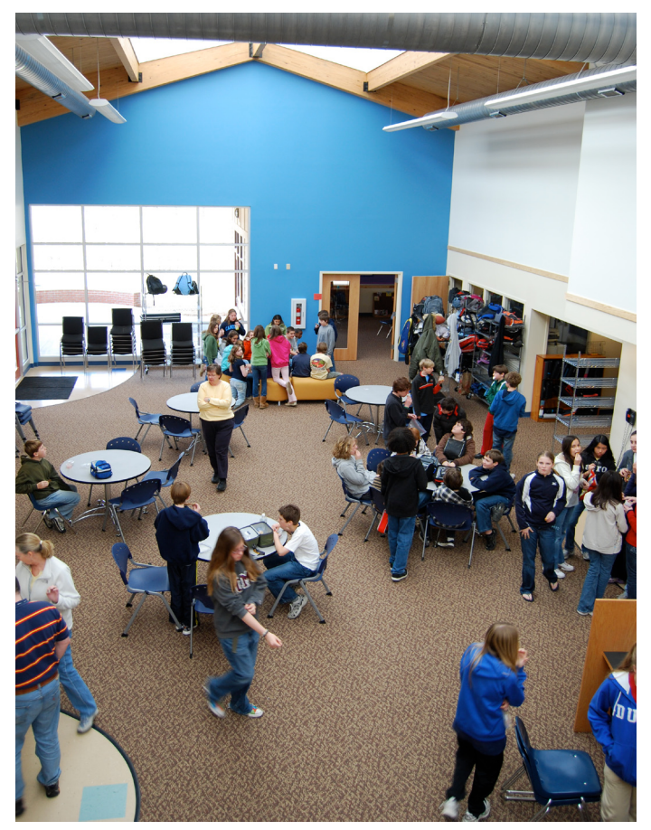
Fig 3 - Above: Indoor public space, the 'Café/Commons' at Duke School, North Carolina, USA. Each of the school's Small Learning Communities has its own Café/Commons.

There are places for solitude and reflection: Another of the Primordial Learning Metaphors noted by Dr. Thornburg is the 'Cave': a space for solitude and quiet reflection. Human beings like this kind of space to face the action: when you are by yourself at an airport gate you generally choose the seat that gives the best vantage point for viewing other people, and which has your back to a wall. Incorporating seating in windowsills and other nooks and crannies in these kinds of spaces makes it OK for students to be by themselves, since they are in a sense 'invited' by the space.