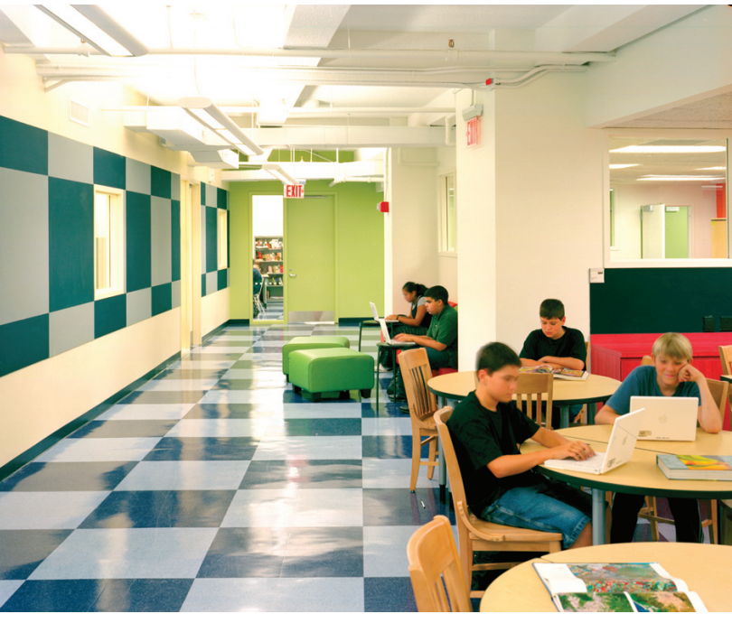
The good news is that in the same way that cities are now being designed to enhance and build social capital, schools are also being designed around these acknowledgements of our human nature. Understanding why this change is important helps teachers and students to be able to use it effectively - in a sense to 'un-train' themselves after years of modifying their behaviour to fit or rebel against the traditional 'cells' (classrooms) of factory model schools.